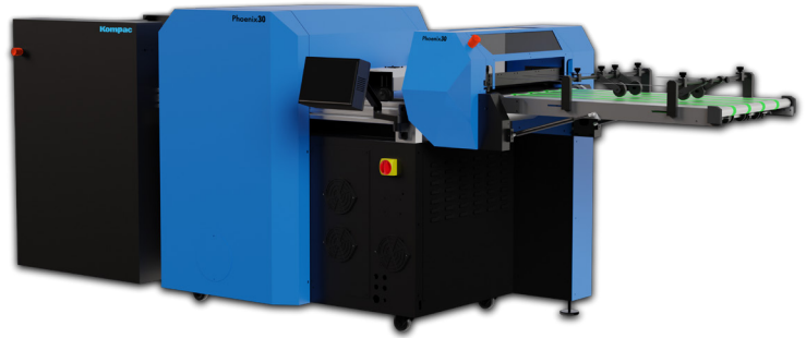
Phoenix 30, shown with available interface conveyor & pallet stacker.

The Phoenix is a revolutionary new coating/priming system that is the most modular system available. The system can utilize one or multiple coating and curing stations and utilizes our unique Kompac IOtech4 platform.